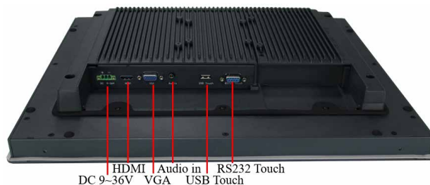
HDMI Audio in RS232 Touch DC 9~36V VGA USB Touch

ALAD-191T-G is a new industrial touch display. ALAD-191T supports 19 inches 1280*1024 TFT LCD, with 5-wire resistive touch screen, optional projected capacitive touch. There are HDMI&VGA video input, Audio input, 2*3W speakers and DC 9~36V wide power input. It is an industrial-standard multimedia display with a variety of installations that is fit for different applications.